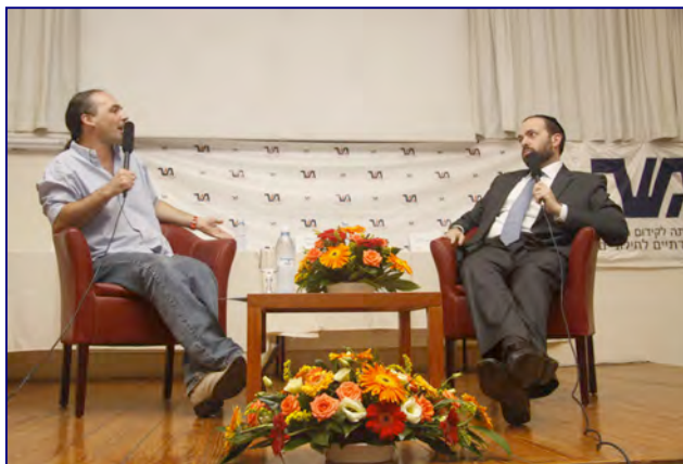
Haredi Housing Minister Ariel Attias with Channel 10 journalist Avishai Ben Haim at the "Segregated Country" Session at Gesher.

In 2010 Gesher embarked on a new initiative. We opened up Beit Gesher for a series of "Town Hall" meetings that were free and open to the public. Our experience with large-scale informal educational and cultural initiatives has put us in a strong position to bring together on a panel opinion-moulders and decision-makers with diverse and competing interests in order to discuss top-of-the-agenda issues facing Israel.