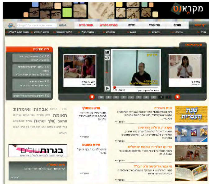
Mikranet Bible Teaching Portal

In development this year is a ground-breaking animated Parshat Hashavua (Bible-portion of the week) which will be featured on the front page of Y-Net, Israel's top news portal, as well as receive top billing on Mikranet. The Y-Net collaboration is a direct result of the editor's participation in the Beit Midrash for Media. In the animations, two novice angels are charged with re-examining the Bible for present day applications. On-line viewers will get a look at their attempts to grapple with the weekly Torah portion every weekend.