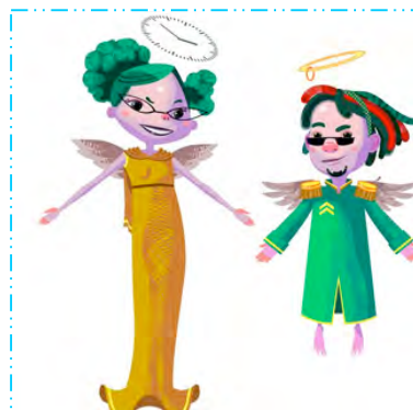
Two of the Stars of Gesher's new Weekly Portion of the Bible Cartoon

In development this year is a ground-breaking animated Parshat Hashavua (Bible-portion of the week) which will be featured on the front page of Y-Net, Israel's top news portal, as well as receive top billing on Mikranet. The Y-Net collaboration is a direct result of the editor's participation in the Beit Midrash for Media. In the animations, two novice angels are charged with re-examining the Bible for present day applications. On-line viewers will get a look at their attempts to grapple with the weekly Torah portion every weekend.